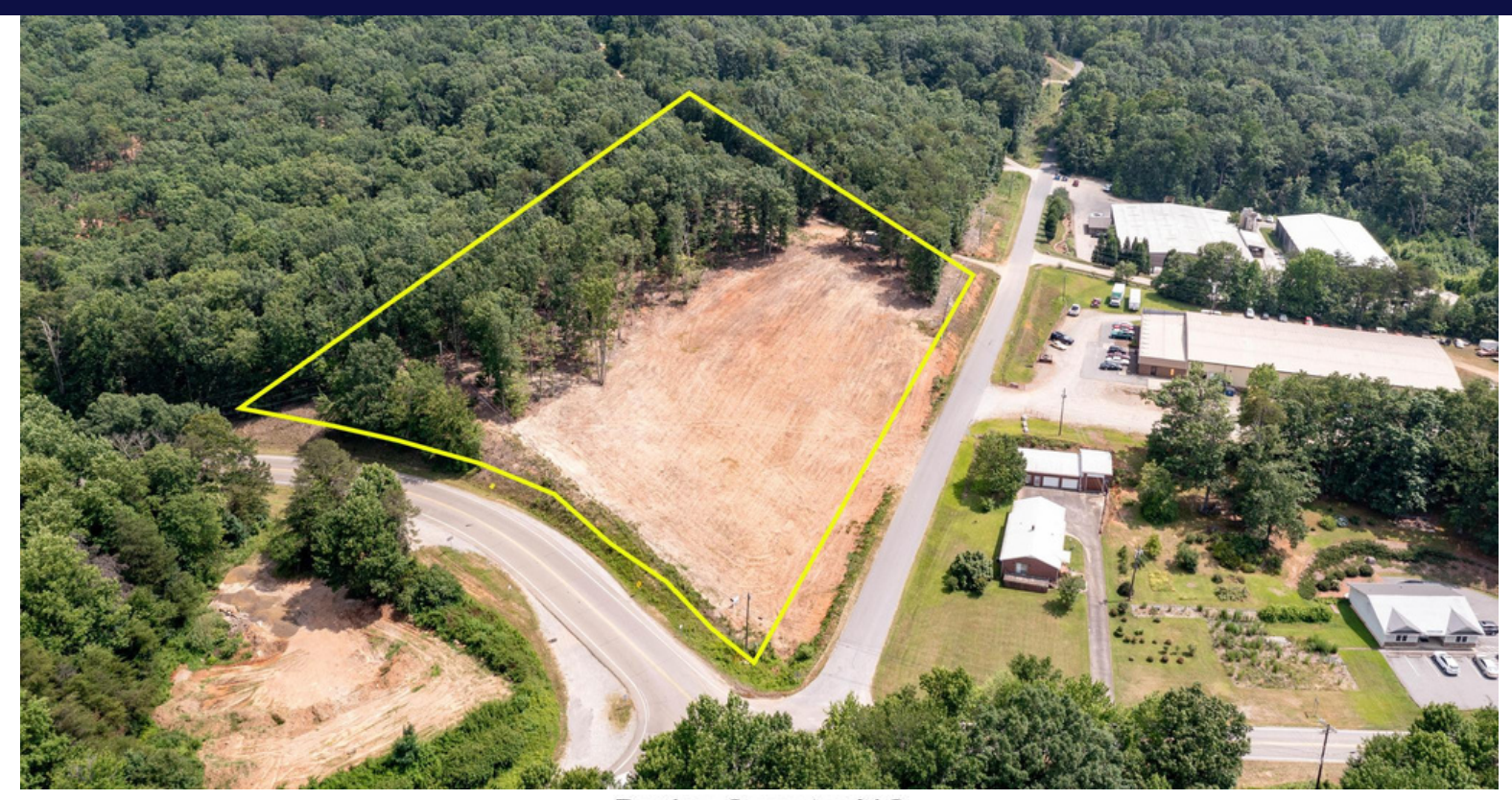
Burke County, NC