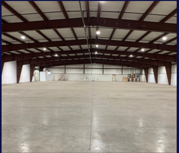
20,400 SF Section