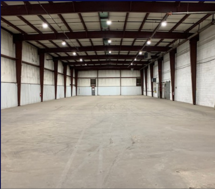
12,000 SF Section